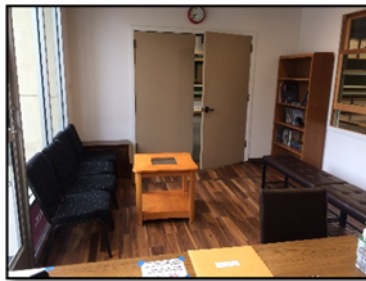
Lobby & Viewing